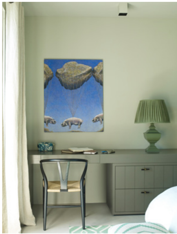
MAIN BEDROOM A built-in shelf with drawers beneath makes a useful workstation and dressing table (above). For this scheme (right), Jutta chose green for its serene, restful quality. Curvy lamp base, £350; 18in lampshade, £375; both Melodi Horne, melodihorne.com. Dhurrie, CHF230sq m, Frohsinn,

frohsinn.ch. 205 table lamps, £359.66 each, Lampe Gras at Spatial Lighting, spatial-lighting.co.uk. Rope stool, €1,098, Riva 1920 at Progarr, progarr.com.